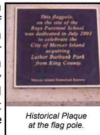
Historical Plaque at the flag pole.